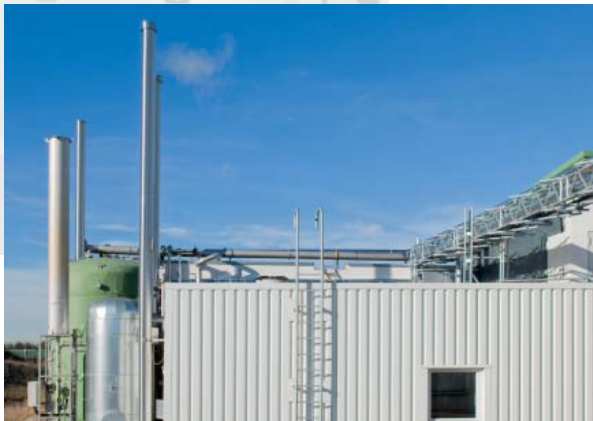
Combined heat and power plants (CHP)

The heat is used as process heat to warm the plant and the adjacent commercial building. A further portion of the heat is used to dry the sieve residue and further substance flows. This combined heat and power generation is particularly encouraged by the EEG (CHP bonus).