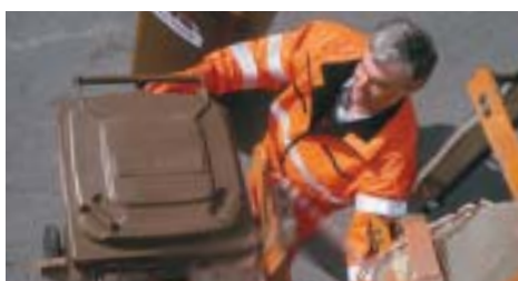
Biowaste collection – AWM collects approximately 40,000 tons per year

The dry fermentation plant is distinguished by the simple and compact construction of its digesters, and, hence, of the entire plant. Its modular design with various digesters allows plant expansion without major expenditures, should the capacity be increased sometime in the future.