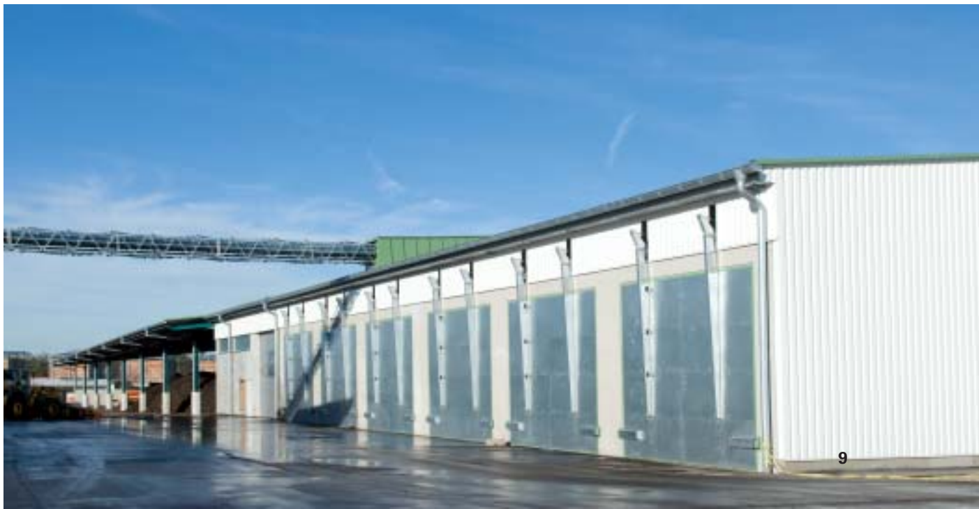
The core of the plant: the garage-like digesters

The waste heat produced during combustion is optimally used by the combined heat and power plant. It serves as process heat and dries the various substances in drying boxes set up especially for this purpose.