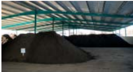
Compost piles: fermentation residues are stacked

finished compost, thanks to its high quality. Private use and use in gardening are both possible, as is agricultural use.